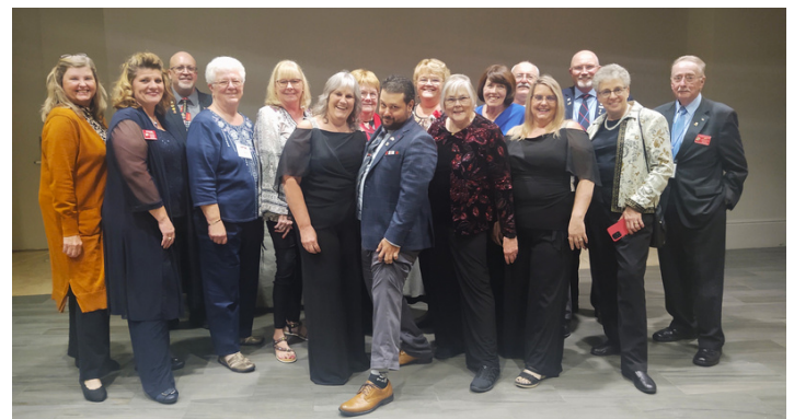
Wisconsin members looking good for Banquet!

Let your Auxiliary legacy members become STARS, for without our STARS, our Auxiliary would not exist. Connect with a legacy member in your Auxiliary and complete a three- to five-minute video interview: Ask why they joined. Ask about their favorite memorable moment(s). Place emphasis on bringing the past to life. If your Auxiliary has no legacy members, look to your District or Department. Submit your video interview and entire form to me by March 31, 2024, for judging.