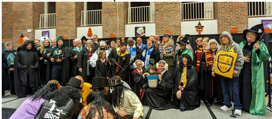
Pictured Above: Wisconsin "Harry Porter" participants during judging by National Officers.